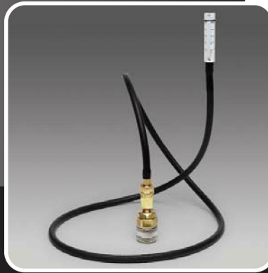
Special hose assembly connects to high side