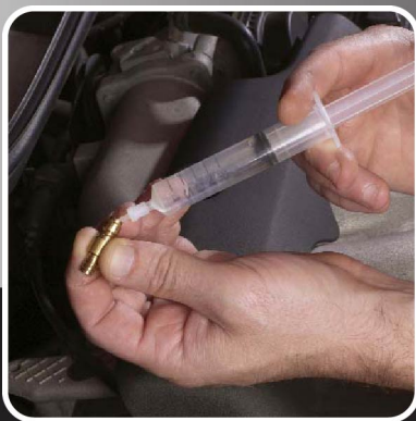
Easy to use test cartridge