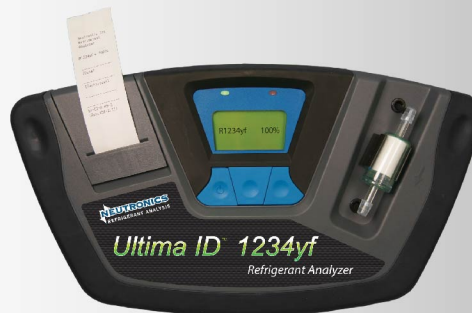
Ultima ID 1234YF